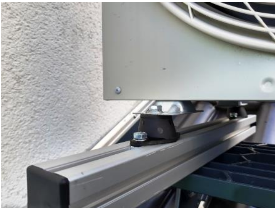
Bild 3 ACE Compression Mounts soothe air conditioning splitter - Alternative.jpg

Four vibration dampers with the type designation COM-52511 from ACE Stoßdämpfer GmbH efficiently isolate the disturbing vibrations and decouple the vibrations permanently from transmission into the building