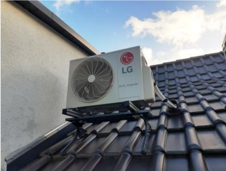
Bild 1 ACE Compression Mounts soothe air conditioning splitter.jpg

Can cool down, but also annoy and damage the construction if the vibrations of an air conditioning splitter are transmitted into the house structure and the interior of the building