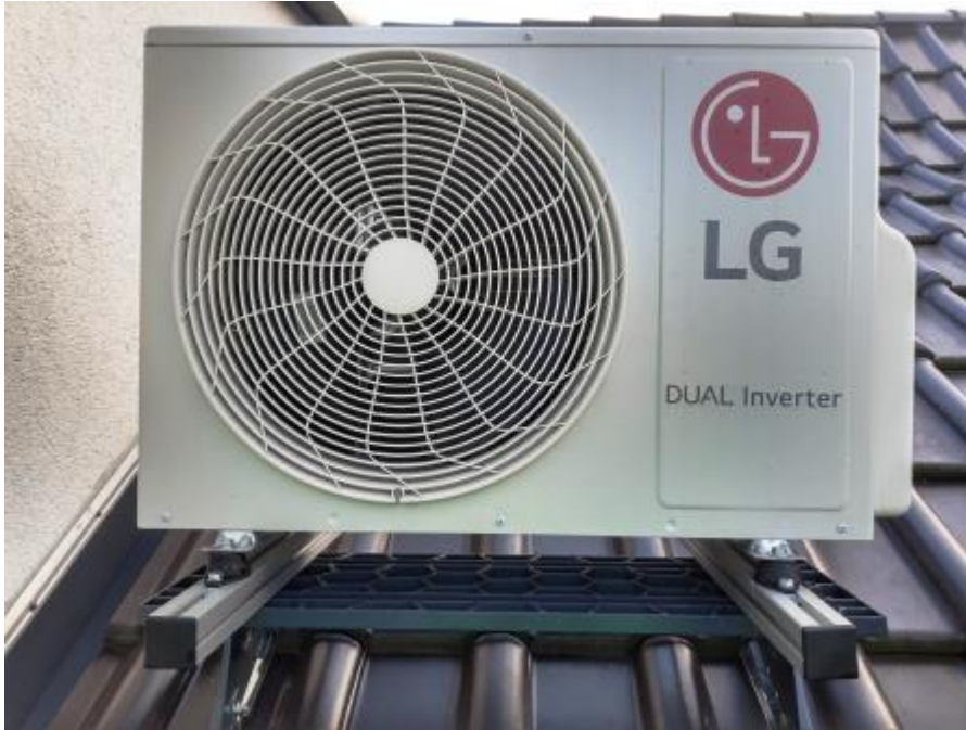
Bild 3 ACE Compression Mounts soothe air conditioning splitter.jpg

Four vibration dampers with the type designation COM-52511 from ACE Stoßdämpfer GmbH efficiently isolate the disturbing vibrations and decouple the vibrations permanently from transmission into the building